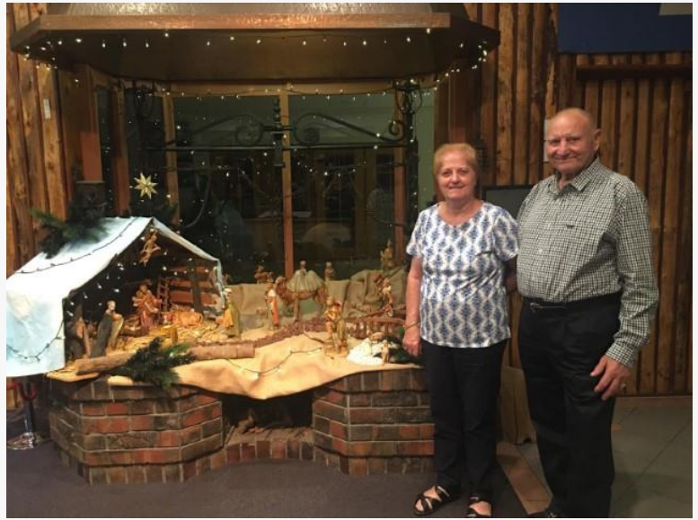
The Piotto welcome the Christmas season sot le nape .