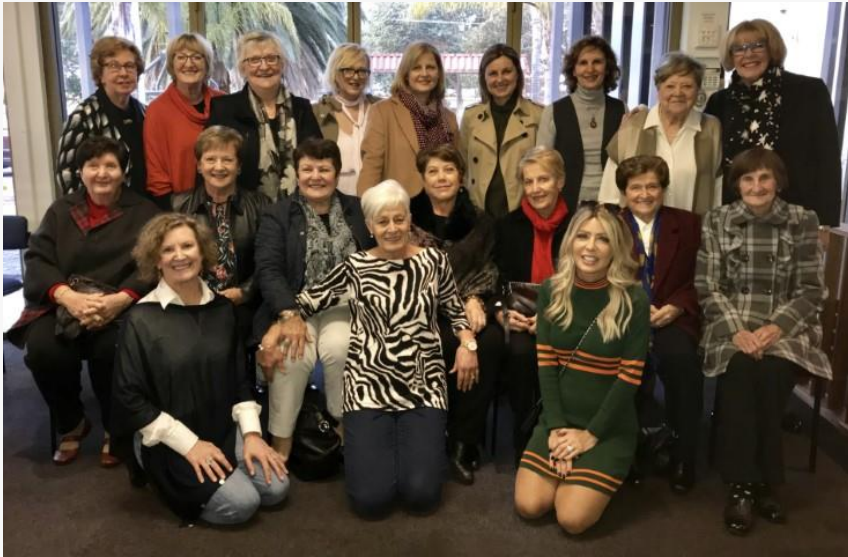
The netball ladies who started playing for the Fogolar Furlan had an impromptu reunion. Seven different teams were represented